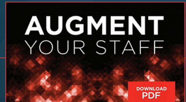
Augment your staff white paper