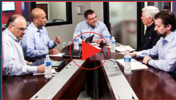
Straight talk on manufacturing operations support video