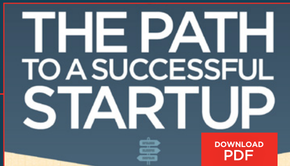
The path to a successful startup